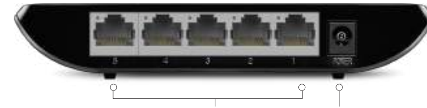
5 10/100/1000Mbps Ethernet Ports Power Socket