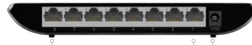
8 10/100/1000Mbps Ethernet Ports Power Socket