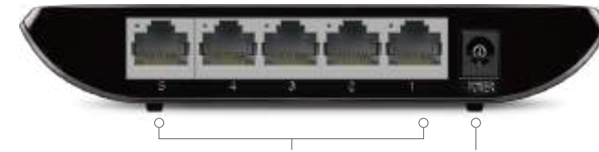
5 10/100/1000Mbps Ethernet Ports Power Socket