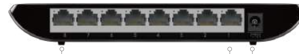
8 10/100/1000Mbps Ethernet Ports Power Socket